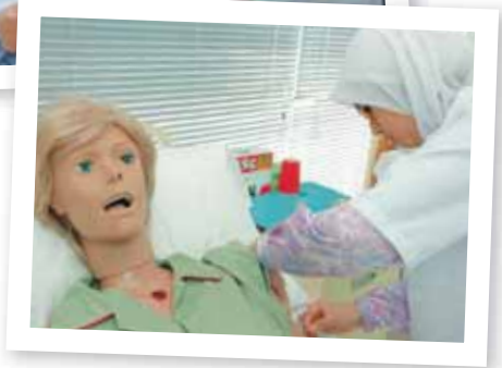
Nursing student learning the technique of giving injections in the Skills Centre