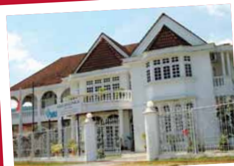
IMU Clinical School, Batu Pahat

Since 1999, the University's growth and development has been in developing clinical schools in Seremban and Batu Pahat, our own Honours degree courses in Pharmacy and Nursing, and in establishing research as a core activity, together with development of postgraduate research Masters and PhD programmes. We are already the preferred private school for medicine and pharmacy in Malaysia. Our growth has been supported by heavy investment in infrastructure development and expansion at Bukit Jalil and Seremban, and in the recruitment of staff of high calibre. In 2008, we have introduced Honours degree courses in Dentistry, Nutrition & Dietetics, Medical Biotechnology, Psychology, Biomedical Science and in Pharmaceutical Chemistry. In common with our MBBS, BPharm and BNursing, these courses have been designed from first principles by our faculty. Bachelor of Nursing Science (Hons) was introduced in 2009, a programme targeted solely for registered nurses to upgrade their qualification from diploma level to a degree level. In 2010, we introduced Chiropractic programme, the first of its kind and only complete educational programme in Malaysia as well as in all of Southeast Asia. In future, the university is planning to offer an undergraduate programme in Chinese Medicine. We believe our courses to be progressive and innovative, and we strive to use best practice in their delivery and assessment.