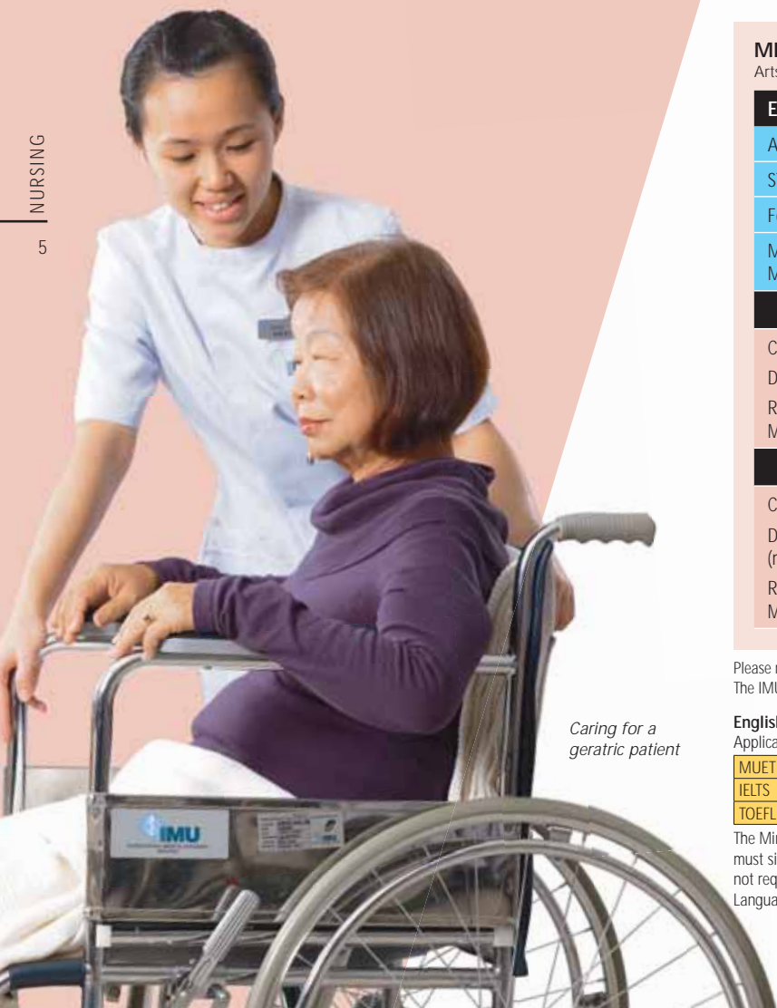
Caring for a geriatric patient