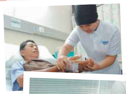
Nursing student doing a "head-to-toe" assessment on a client

You can apply using your forecast or actual exam results.