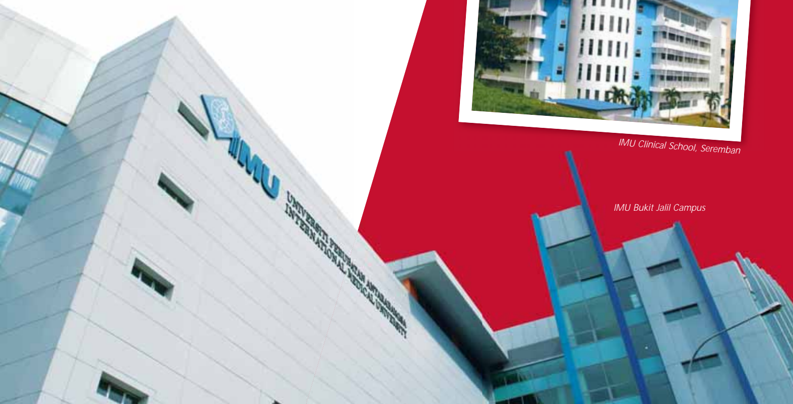
IMU Bukit Jalil Campus