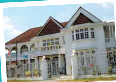
IMU Clinical School, Batu Pahat

Since 1999, the University's growth and development has been in developing clinical schools in Seremban and Batu Pahat, our own Honours degree courses in Pharmacy and Nursing, and in establishing research as a core activity, together with development of postgraduate research Masters and PhD programmes. We are already the preferred private school for medicine and pharmacy in Malaysia. Our growth has been supported by heavy investment in infrastructure development and expansion at Bukit Jalil and Seremban, and in the recruitment of staff of high calibre. In 2008, we have introduced Honours degree courses in Dentistry, Nutrition & Dietetics, Medical Biotechnology, Psychology, Biomedical Science and in Pharmaceutical Chemistry. In common with our MBBS, BPharm and BNursing, these courses have been designed from first principles by our faculty. Bachelor of Nursing Science (Hons) was introduced in 2009, a programme targeted solely for registered nurses to upgrade their qualification from diploma level to a degree level. In 2010, we introduced Chiropractic programme, the first of its kind and only complete educational programme in Malaysia as well as in all of Southeast Asia. In future, the university is planning to offer an undergraduate programme in Chinese Medicine. We believe our courses to be progressive and innovative, and we strive to use best practice in their delivery and assessment.