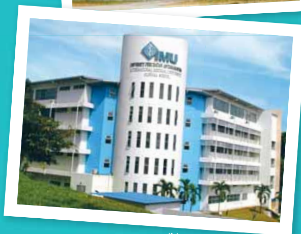
IMU Clinical School, Seremban