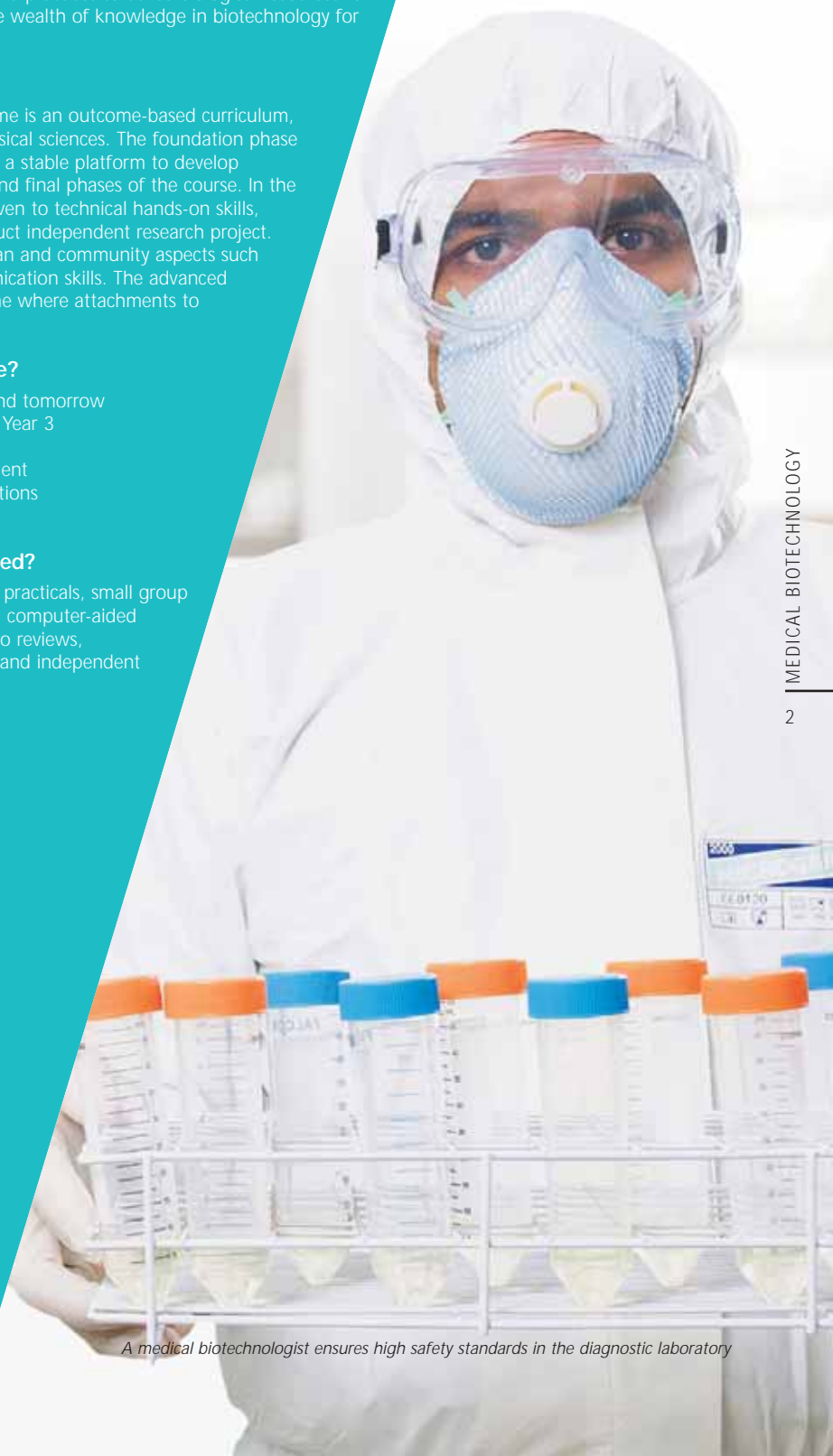
A medical biotechnologist ensures high safety standards in the diagnostic laboratory

Credit transfer option to the University of Newcastle, Australia.