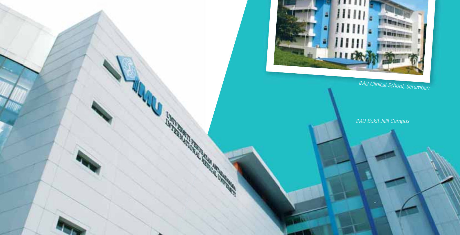
IMU Bukit Jalil Campus