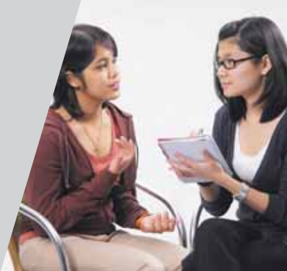
Counselling psychologist conducting a session with a client

Psychology staff come from many countries and are therefore able to inject a unique international perspective into their teaching, enabling IMU students to have a global, multicultural outlook.