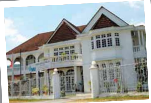
IMU Clinical School, Batu Pahat

Since 1999, the University's growth and development has been in developing clinical schools in Seremban and Batu Pahat, our own Honours degree courses in Pharmacy and Nursing, and in establishing research as a core activity, together with development of postgraduate research Masters and PhD programmes. We are already the preferred private school for medicine and pharmacy in Malaysia. Our growth has been supported by heavy investment in infrastructure development and expansion at Bukit Jalil and Seremban, and in the recruitment of staff of high calibre. In 2008, we have introduced Honours degree courses in Dentistry, Nutrition & Dietetics, Medical Biotechnology, Psychology, Biomedical Science and in Pharmaceutical Chemistry. In common with our MBBS, BPharm and BNursing, these courses have been designed from first principles by our faculty. Bachelor of Nursing Science (Hons) was introduced in 2009, a programme targeted solely for registered nurses to upgrade their qualification from diploma level to a degree level. In 2010, we introduced Chiropractic programme, the first of its kind and only complete educational programme in Malaysia as well as in all of Southeast Asia. In future, the university is planning to offer an undergraduate programme in Chinese Medicine. We believe our courses to be progressive and innovative, and we strive to use best practice in their delivery and assessment.