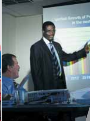
Organisational psychologist presenting results in a meeting

“Lecturers come from diverse backgrounds and are keen to share their personal experiences in their own fields of psychology. This makes our learning experience enjoyable, interesting and rewarding.”