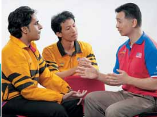
Sport psychologist helping athletes to increase their focus