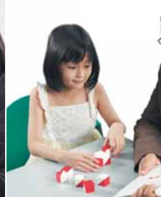
Clinical psychologist assessing a child's spatial