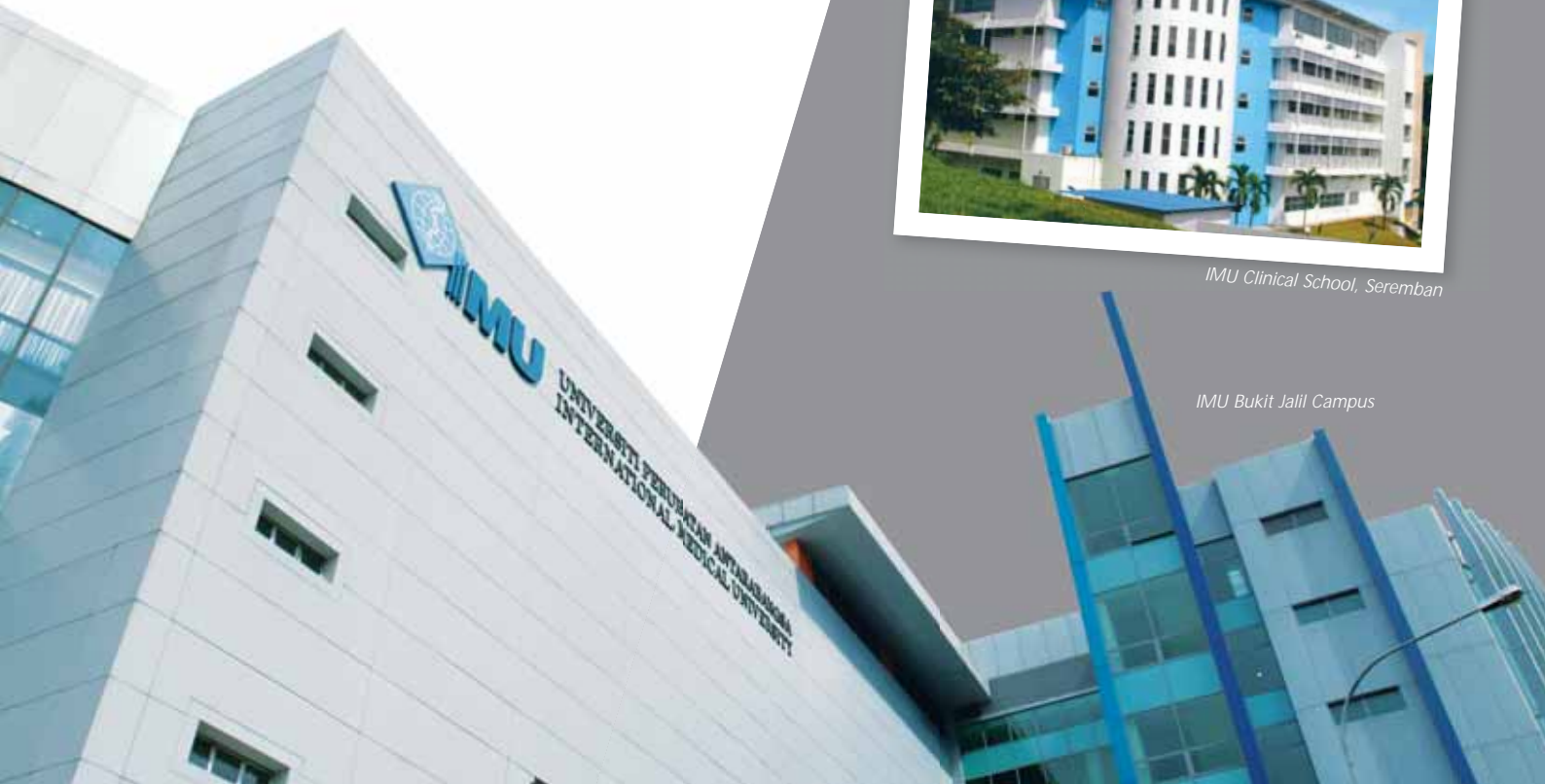
IMU Bukit Jalil Campus