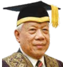
2002 YBhg Tan Sri Datuk Amar Dr Sulaiman Haji Daud Honorary Doctor of Medicine