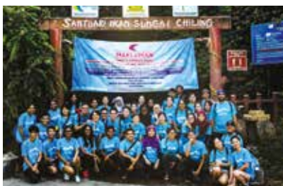
A Students-Alumni Adventure at Chilling Waterfalls Hiking Trip in Kuala Kubu Bharu.