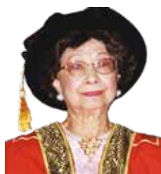
2003 YABhg Tun Dr Siti Hasmah bt Haji Mohd Ali Honorary Doctor of Medicine