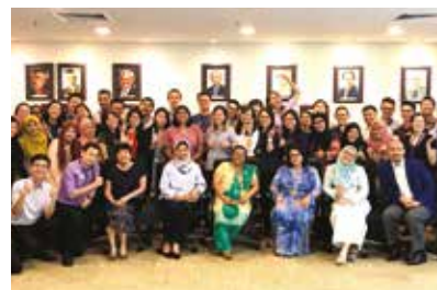
Alumni Gathering: Kuala Lumpur, celebrating alumni who came back to work in IMU.