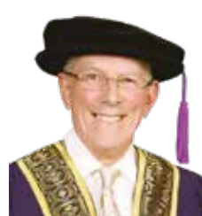
2012 Prof Ronald M Harden Honorary Doctor of Medical Education