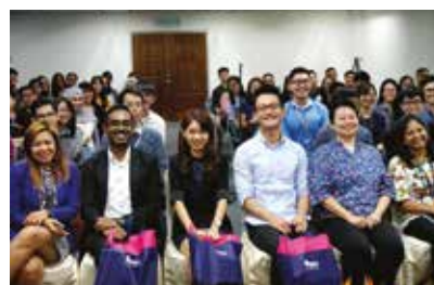
Career Enhancement Talk: Diversify Your Skills To Build A Better Career by the alumni from three different programmes.