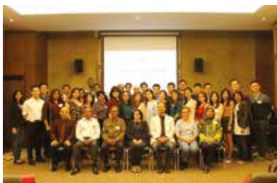
Alumni Gathering held in Penang.