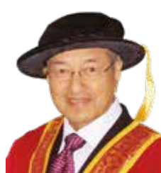
2009 YABhg Tun Dr Mahathir Mohamad Honorary Doctor of Medicine