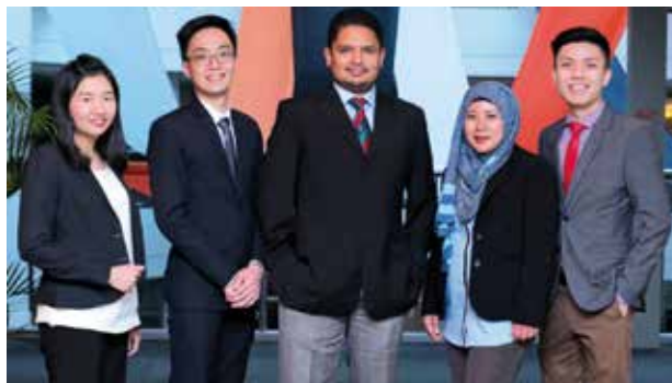
2019 IMU Alumni Association

FEATURED ALUMNI - We want employers, institutions and individuals to know where you studied and where