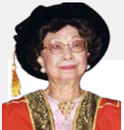
2003 YABhg Tun Dr Siti Hasmah bt Haji Mohd Ali Honorary Doctor of Medicine