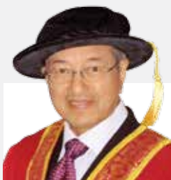
2009 YABhg Tun Dr Mahathir Mohamad Honorary Doctor of Medicine