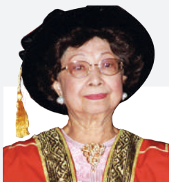
2003 YABhg Tun Dr Siti Hasmah bt Haji Mohd Ali Honorary Doctor of Medicine