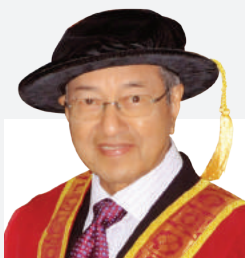
2009 YABhg Tun Dr Mahathir Mohamad Honorary Doctor of Medicine