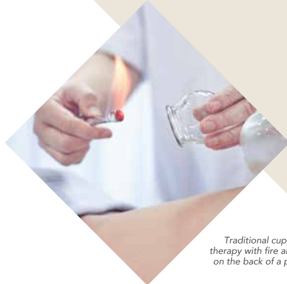
Traditional cupping therapy with fire and glass on the back of a patient.