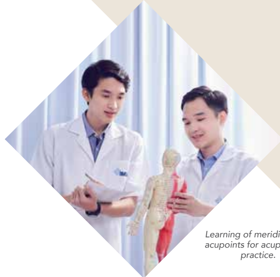
Learning of meridians and acupoints for acupuncture practice.