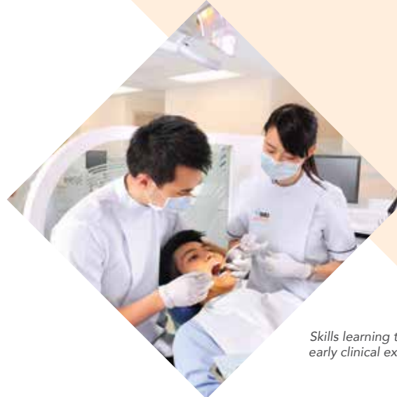
Skills learning through early clinical exposure.