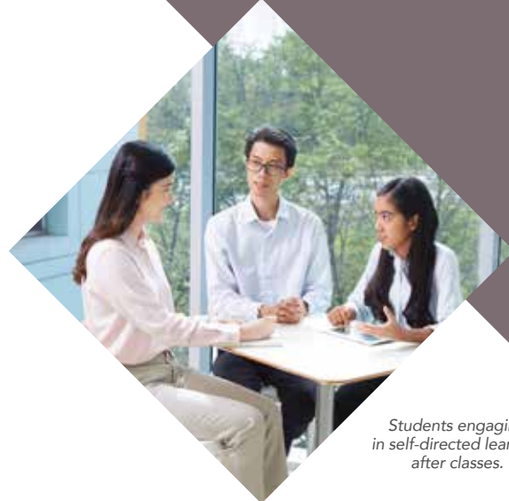
Students engaging in self-directed learning after classes.