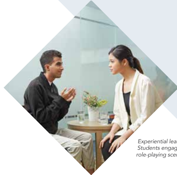
Experiential learning: Students engaging in role-playing scenarios.